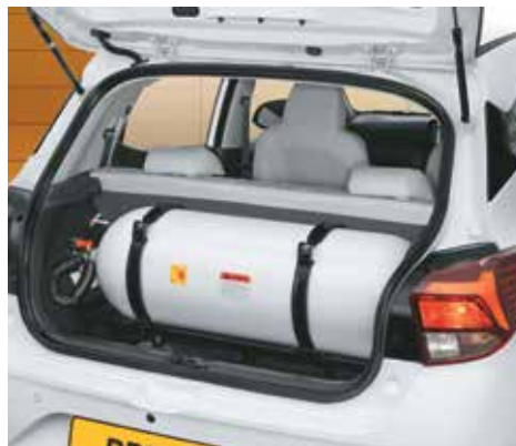
Factory fitted CNG