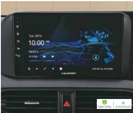
22.96 cm (9") infotainment system Wireless Android Auto & Apple CarPlay