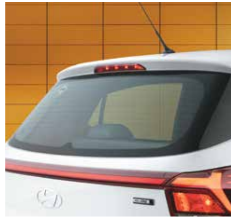
Rear defogger | Roof antenna