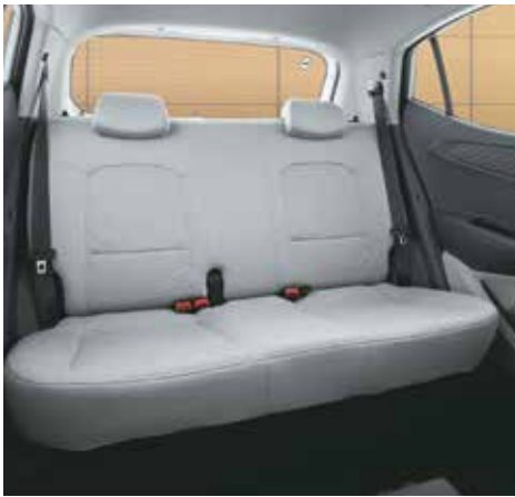
Spacious legroom & kneeroom