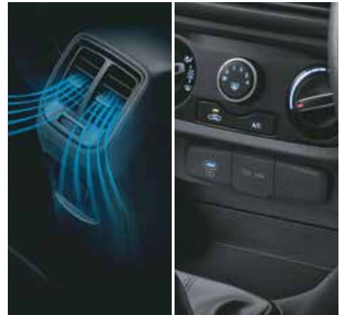
Rear AC vents | Fast USB charger (Type C) Front and rear 12V power socket