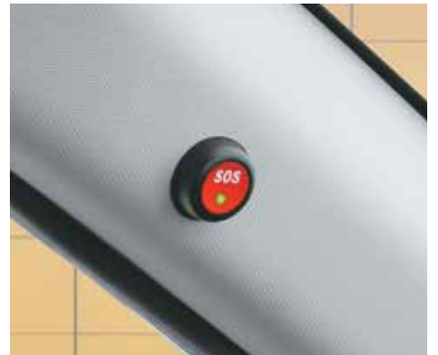
Vehicle location tracking device with panic buttons (4)

Other features: Speed limiting function | Central locking | Burglar alarm | Footwell lighting