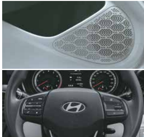
Speakers | Steering wheel mounted controls