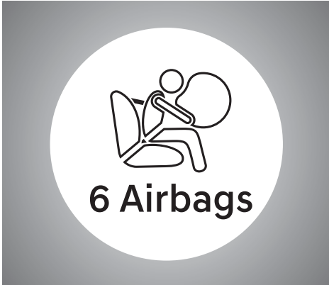
6 Airbags - Driver, passenger, side & curtain