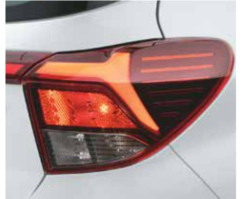
LED tail lamps