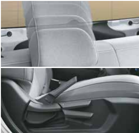
Adjustable rear headrests Driver seat height adjustment