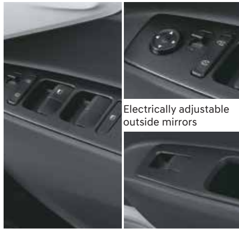
Front and rear power windows